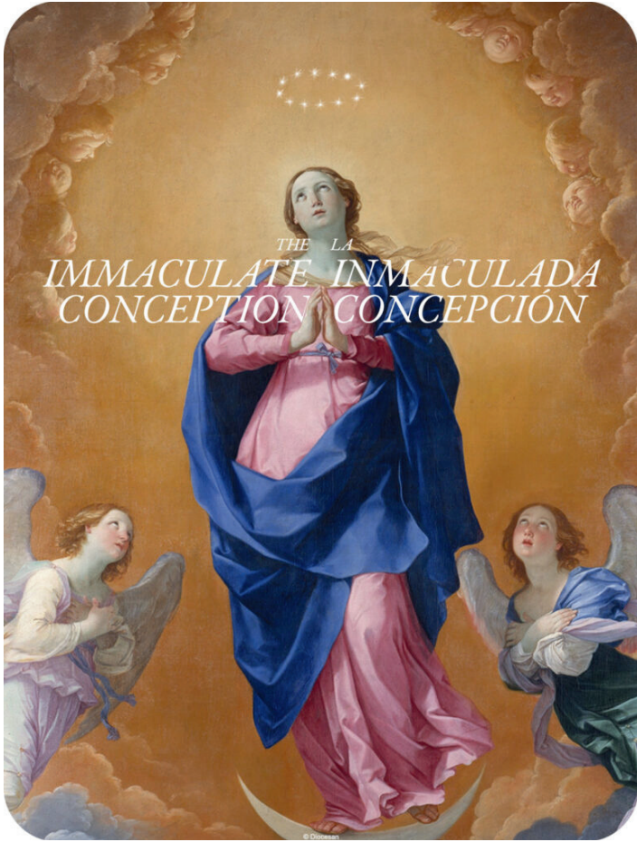
THE LA IMMACULATE INMACULADA CONCEPTION CONCEPCIÓN

The term "Immaculate Conception" has a long history. Early in Christian history, the Church held that, being "full of grace" (Luke 1 : 28), she was without sin. Later, Pope Pius IX established in his declaration Ineffabilis Deus on December 8, 1854, definitively & infallibly declaring: "in the first instance of her conception, by a singular privilege & grace granted by God, in view of the merits of Jesus..., [Mary] was preserved exempt from all stain of Original Sin." This term later played a significant role in establishing that a girl, Bernadette, was neither lying nor hallucinating, as she identified the mysterious woman who asked for a shrine to be built, calling herself "the Immaculate Conception." The clergy then knew that she could not have arrived at that title on her own, & supported her from then on.