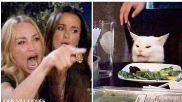
made with mematic